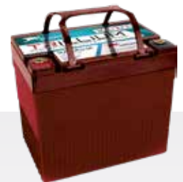
TR 25.6-25 LI-ION

Microprocessor Amp-Hour Life Tracking SOC Gauge Battery Management System Cell Balancing