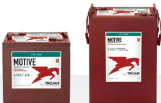
MOTIVE 6-VOLT AGM