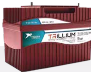
TR 12.8-110 LI-ION

Microprocessor Cell Balancing CAN Communications Amp-Hour Life Tracking SOC Gauge Battery Management System