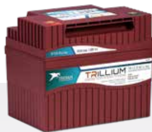
TR 12.8-92 LI-ION

Microprocessor Cell Balancing CAN Communications Amp-Hour Life Tracking SOC Gauge Battery Management System