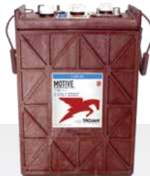
RUGGED MOTIVE 6-VOLT