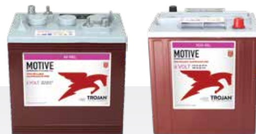
MOTIVE 6-VOLT GEL