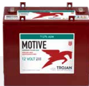
MOTIVE 12-VOLT AGM