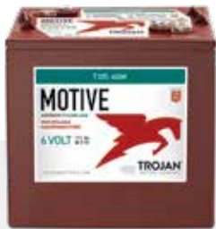
MOTIVE 6-VOLT AGM