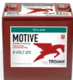
MOTIVE 8-VOLT AGM