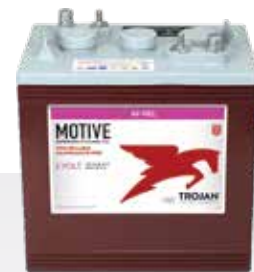
MOTIVE 6-VOLT GEL