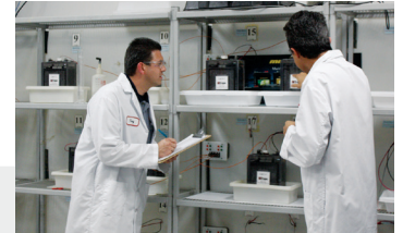
Prototype development and evaluation

To ensure the quality and superior performance of our batteries, Trojan applies the most rigorous testing procedures in the industry to test for cycle life, capacity, charger algorithms and both physical and mechanical integrity. Trojan's battery testing procedures adhere to both BCI and IEC test standards. Trojan's state-of-the-art R&D facilities include charger characterization and analytical labs, battery prototype and evaluation labs and battery autopsy centers all dedicated to providing you with a superior battery that you can rely on.